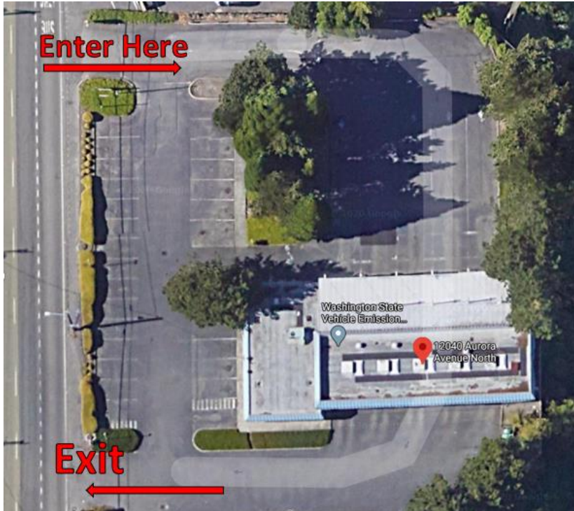
Satellite Image of Aurora Site

Address (links to Google Maps): 12040 Aurora Ave N, Seattle WA 98133